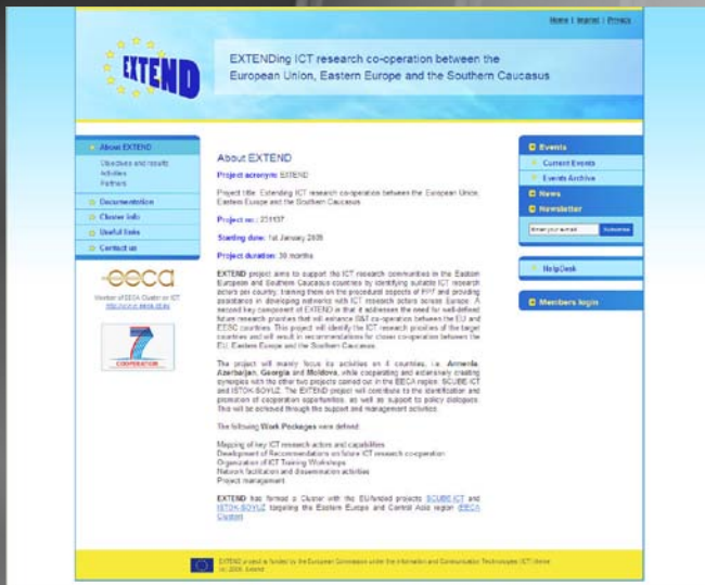
EXTEND web-site www.extend-ict.eu