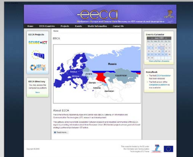
EECA Portal www.eeca-ict.eu