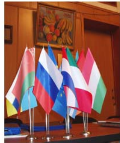
Teams from Italy, Greece, Hungary, the Netherlands, Armenia, Belarus, Kazakhstan, Russian Federation, and Ukraine joined their efforts in the project

ties of KRUAB countries in the relevant fields in EU countries * Organise awareness and training activities